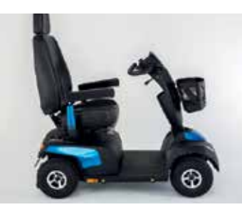
Seat suspension module offers additional comfort by adding an optional seat suspension.