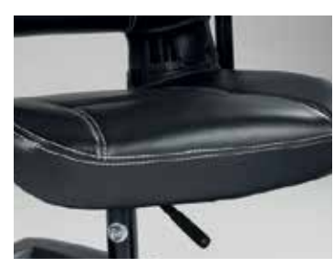
A soft padded seat provides additional comfort