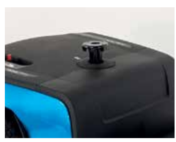
Reinforced seat column offers additional stability and safety when seated.