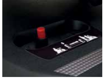
Two step disengaging lever prevents the scooter from accidentally free-wheeling.

Easy drive direction stability keeps you in a straight line at high speeds for additional safety and stability.