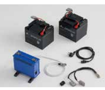
An optional off boardcharger allows you to conveniently charge the batteries away from the scooter.