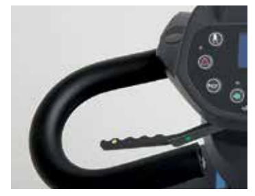
Ergonomically designed steering system makes for easier, more responsive control.