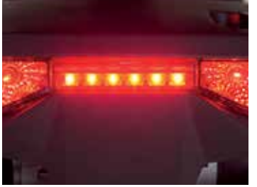
Clear, bright brake lighting warns people that the scooter is slowing down.