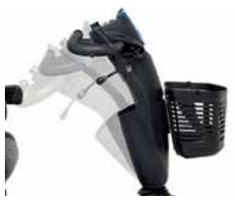
Users can easily adjust the tiller with a lever to suit their needs.