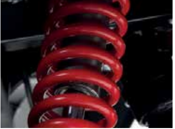
Advanced suspension for a smooth and comfortable drive over rugged terrain.

Easy drive direction stability keeps you in a straight line at high speeds for additional safety and stability.