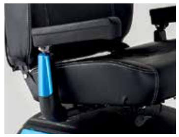
Reinforced height and width adjustable armrest.