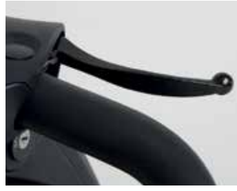
Ensures immediate braking if required.