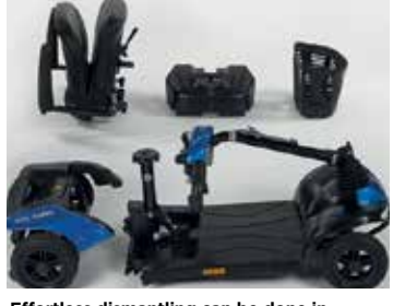
Effortless dismantling can be done in less than a minute for transportation.