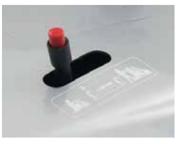
This unique two-step disengaging lever prevents the scooter from accidentally freewheeling.