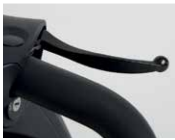
Ensures immediate braking if required.