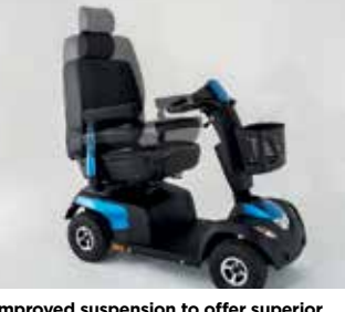
Improved suspension to offer superior comfort to larger individuals.