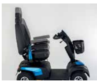
Seat riser electronically increase the seat height to achieve a preferred driving height.