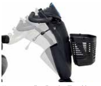
Users can easily adjust the tiller with a lever to suit their needs.