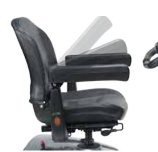
Swivel functionality and sliding rails ensure optimal seating position.

that the scooter is slowing down, thus preventing collisions.