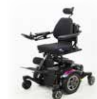
7" Elevating Seat