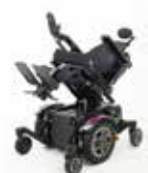
45° CG Tilt