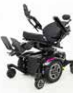
Power Centre Mount